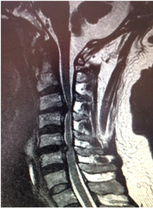
Fig. 1. Pre-operative MRI showing C3–C4 and C5–C6 disc herniation and ischemic T2-hyperintense signs of the cervical cord in C3–C4.

documented multiple cervical stenosis with voluminous C3–C4 and C5–C6 disc herniations associated to T2-hyperintense myelomalacic area at C3–C4 level. (Fig. 1).