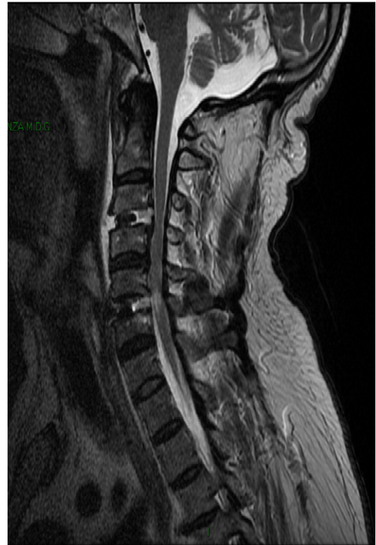
Fig. 3. Post-operative MRI showing the correct placement of cages, cervical decompression and the extension of ischemic T2-hyperintense signal along the cervical cord on C5–C6.

A neck collar was then placed and an immediate cervical-spine CT imaging confirmed the correct execution of ACDF. (Fig. 2)