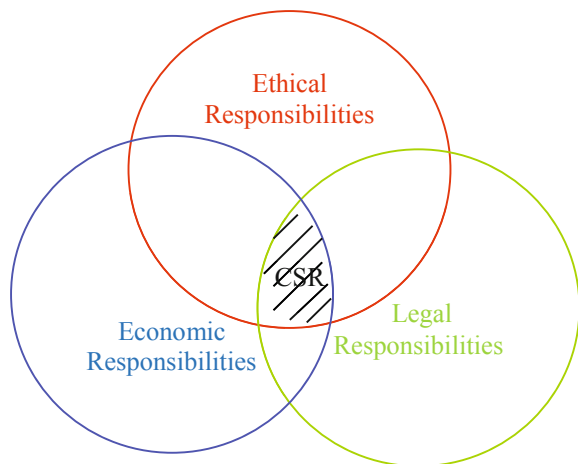
Figure 2: Model of three domains of CSR (Schwartz and Carroll, 2003)

In this paper, we suggested a theoretical analysis about the approach of “ethical responsibilities” of Corporate Social Responsibility. This thesis was based on the problems of employees’ vocational training practice within the firm. After showing the ethical problems of this practice, especially the inequality of access to the training of different professional categories, we argue the necessity of “ethical responsibilities” of Corporate Social Responsibility. Actually, the “economic responsibilities” and “legal responsibilities” are not enough to do business. The firm must stand out from all others by going further in their social responsibility. We are agree that the firm can make profit and make the world a better place at the same time (Falck and Heblich, 2007).