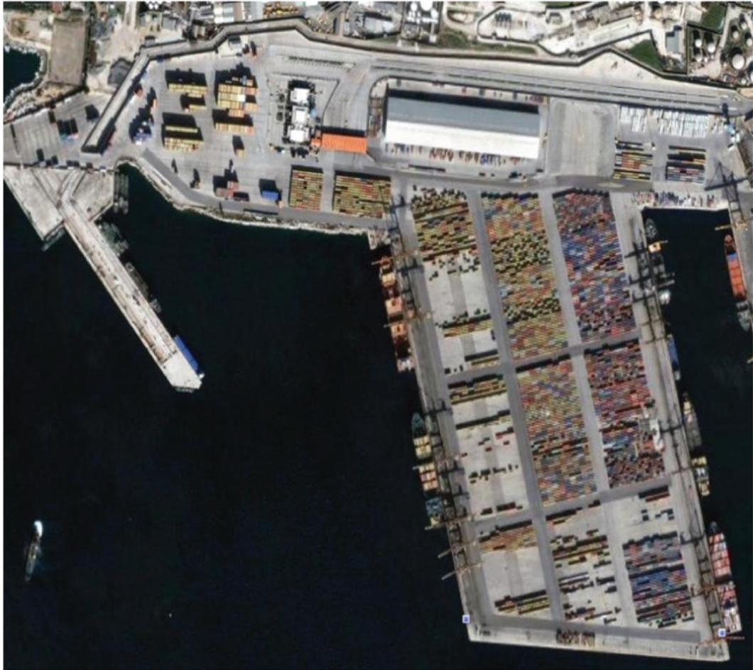
Photo of pier III (left, under construction) and pier II (right, operational) of the Piraeus container terminal, both of which are included in Cosco's 2009 concession.